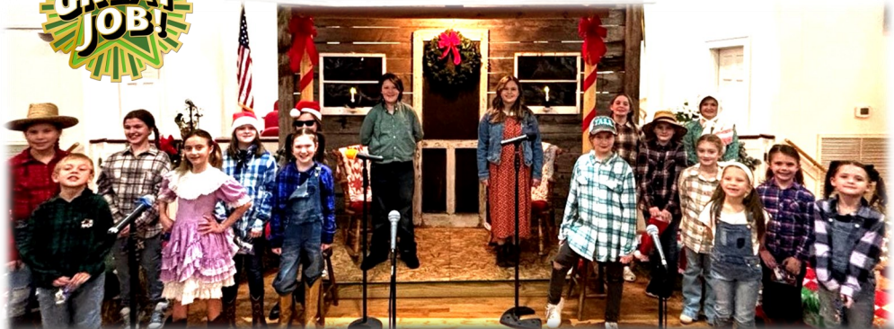
Our Kid's Choir performed "It Happened in the Country" Sunday, Dec. 15th