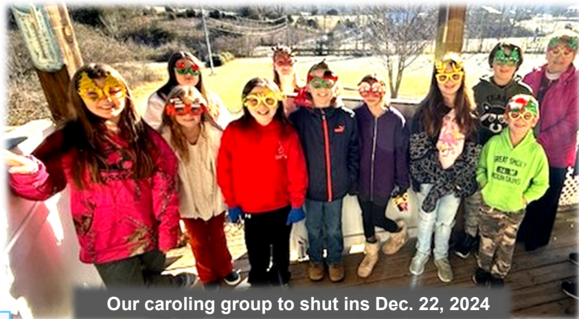
Our caroling group to shut ins Dec. 22, 2024